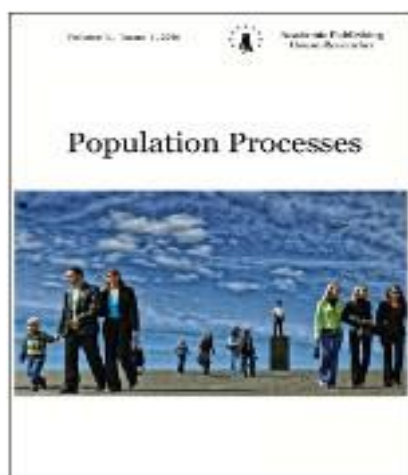
Fig. 1. Appearance of the journal “Population Processes 2016–2021 years) ( Academic Publishing House Researcher, 2021 )