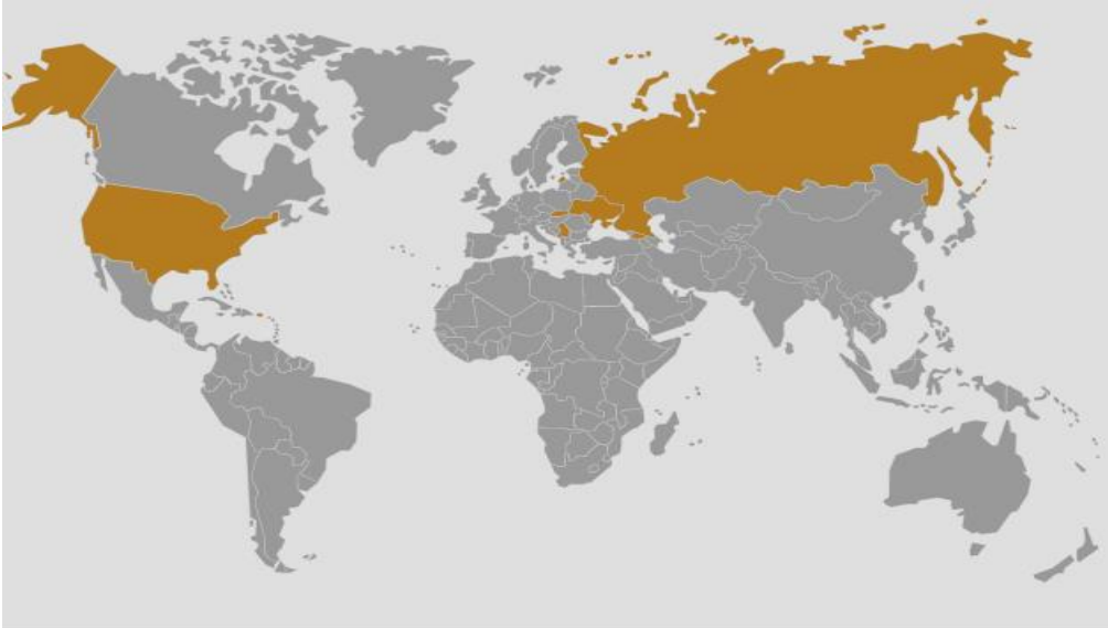
Fig. 2. Geographical distribution – Authors Journal “Population Processes”